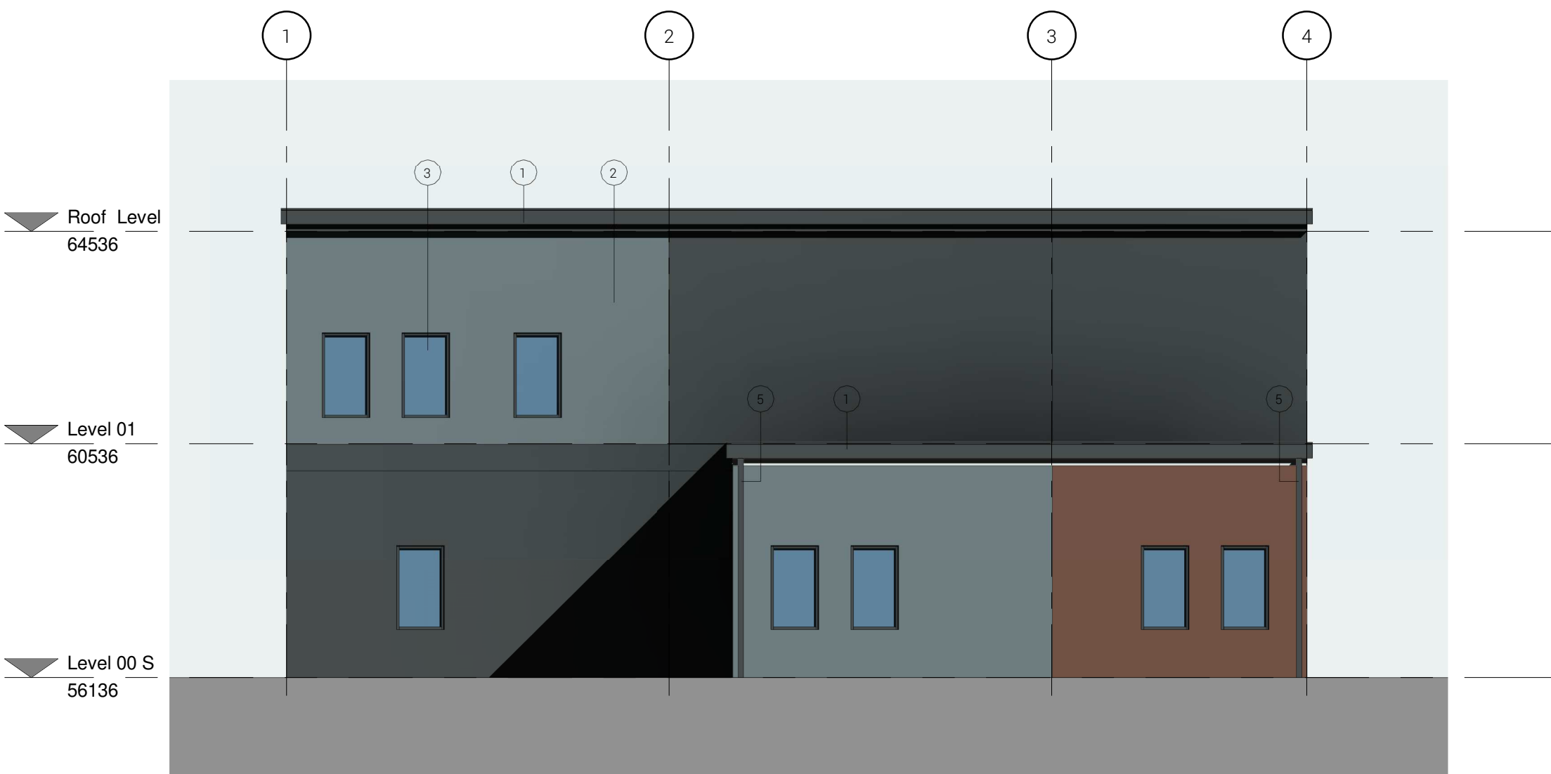
Proposed South Elevation 1 : 100