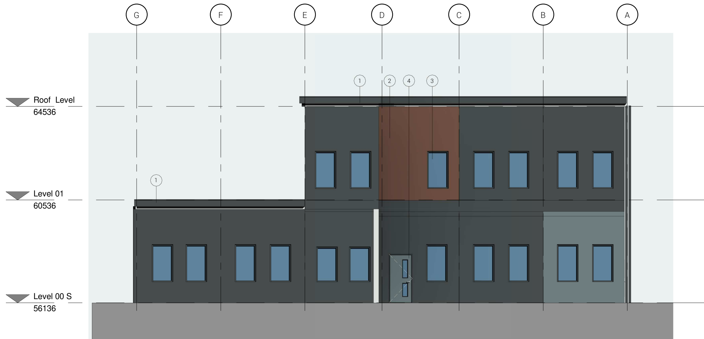
Proposed East Elevation 1 : 100